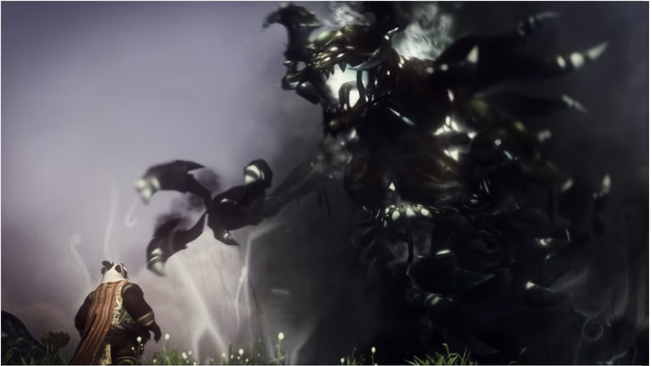
The Sha Released: Screenshot By Rease