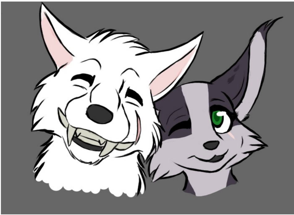
Stoneheart and Vixelda: Art done by Wildheart Wolfsong