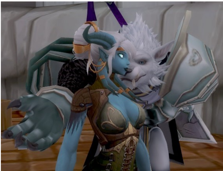
The Flirty Gentleman Screenshot By Assiar