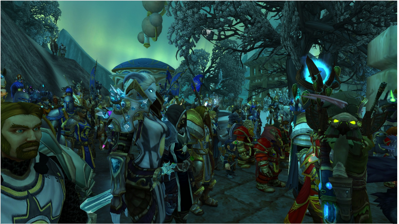
The Muster At Northrend: Screenshot By Rease